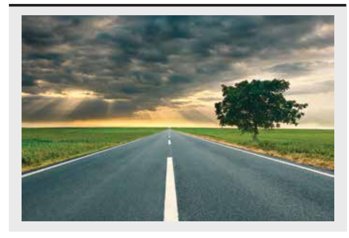
Figure 3: Typical Category 2 - Open Terrain

Terrain Category defines the way wind flows towards a structure. The hyFRAME building systems have been designed to cater for structures in Terrain Categories 2 and above. AS/NZS 1170.2 defines Terrain Category 2 as "Open Terrain, including grassland, with well scattered obstructions having heights generally from 1.5m to 5.0m, with no more than two obstructions per hectare, e.g farmland and cleared subdivisions with isolated trees and uncut grass". Figure 3 illustrates a typical Terrain Category 2 area.